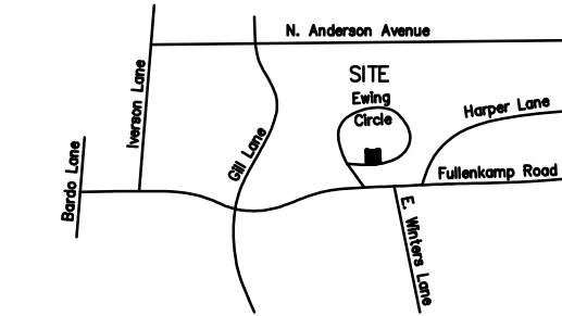
LOCATION MAP No Scale