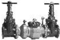
DC & DCDA