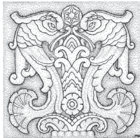
Photography, Illustration, and Layout by Scott Nitza www.scottnitza.com